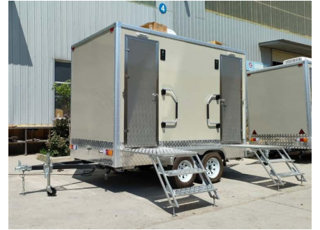
- Side -