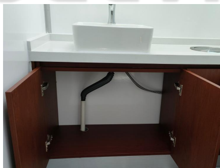
- Storage -