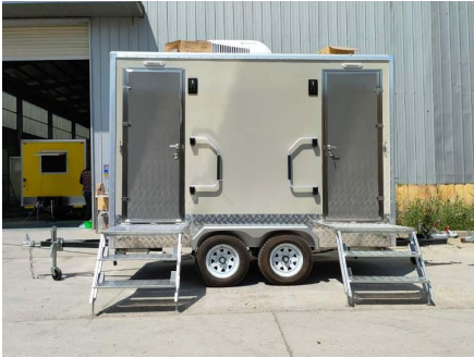
- Front -