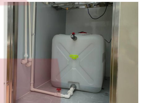
- Clean Water Tank -