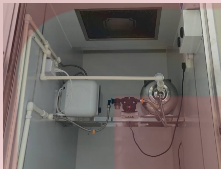
- Water Supply Kits -