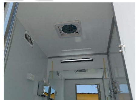
- Vent -