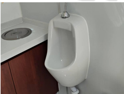
- Urinal -