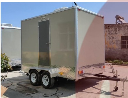
- Mechanical Room -