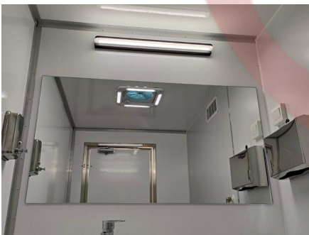
- Mirror -