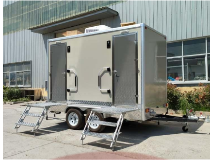
- Side -