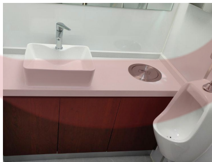
- Sink -